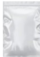
Three Side Seal