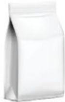
Flat Bottom Bags