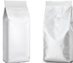
Side Gusset Bags