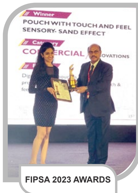
FIPSA 2023 AWARDS