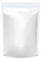
Stand Up Pouches